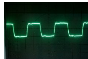
Fig.3 Square Wave 20KHz

Measured by LEADER LAG-126 Audio Signal Generator and KENWOOD CS-4125 Oscilloscope