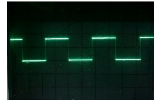
Fig.2 Square Wave 1KHz