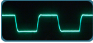
Figure 3 Square wave response at 10 kHz Measured by Tektronix CFG 253 Oscillator and KENWOOD CS-4125 Oscilloscope