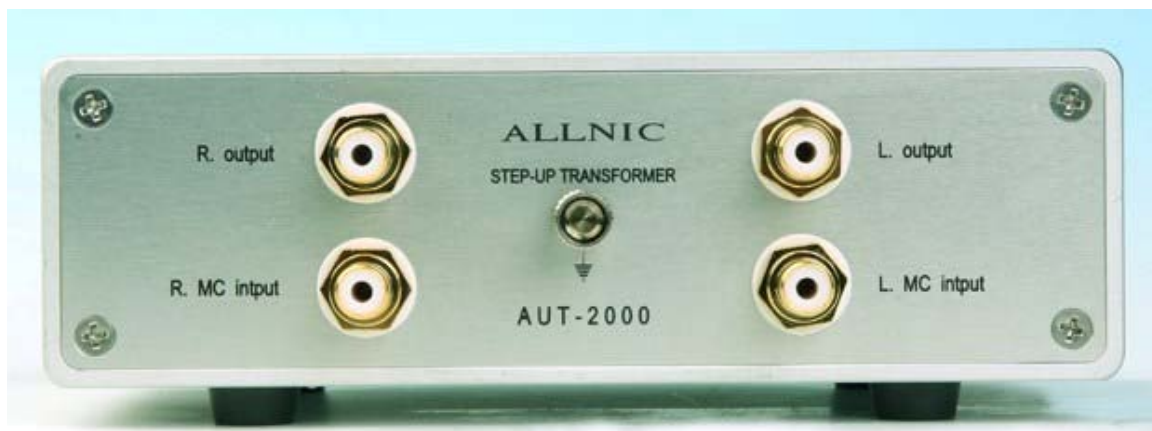
Figure 4 – AUT 2000 Rear Panel View